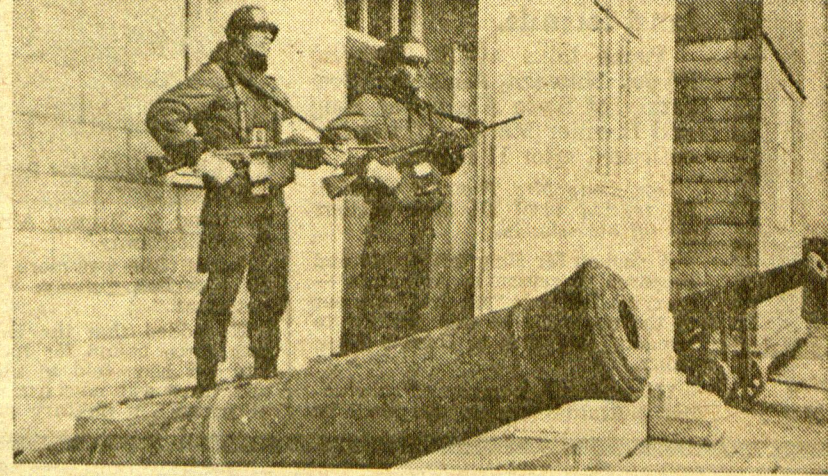
The guns that wait . . . Argentine troops on guard in the Falklands

SPECIAL OFFER 24 EXP COLOUR PRINT FILMS ONLY £1.09 EACH. SIZE 135 110 126 Please tick box for finish required. LUSTRE GLOSSY