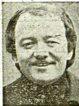
Red Ken: "Hysterics"